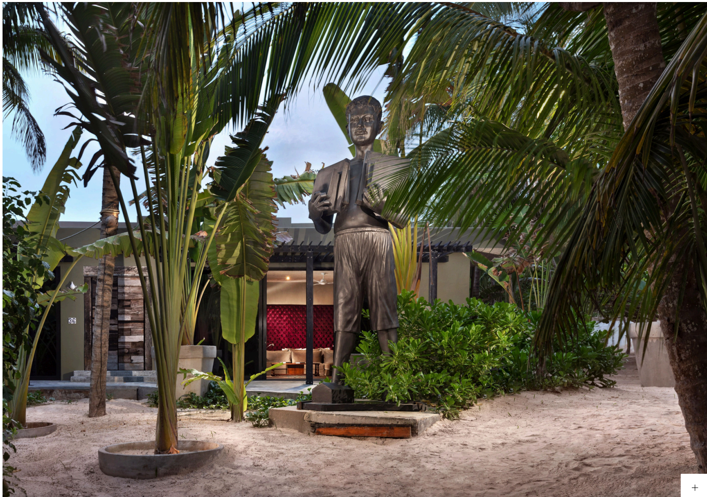
Casa Malca, Tulum, Mexico.