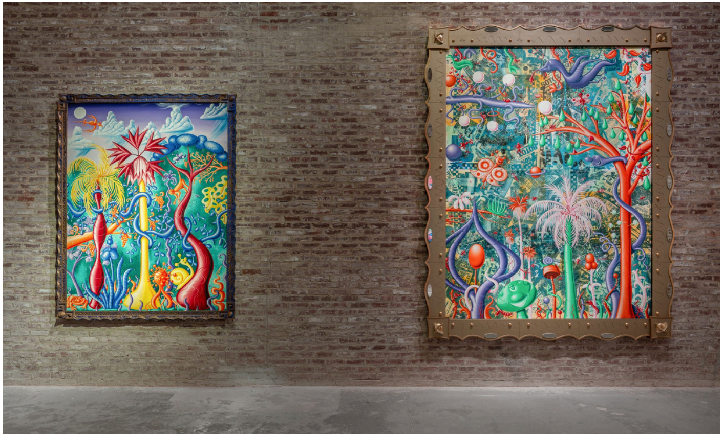
Exhibition view: Kenny Scharf, Space Travel, 60 White, New York (3 December 2024–28 February 2025).