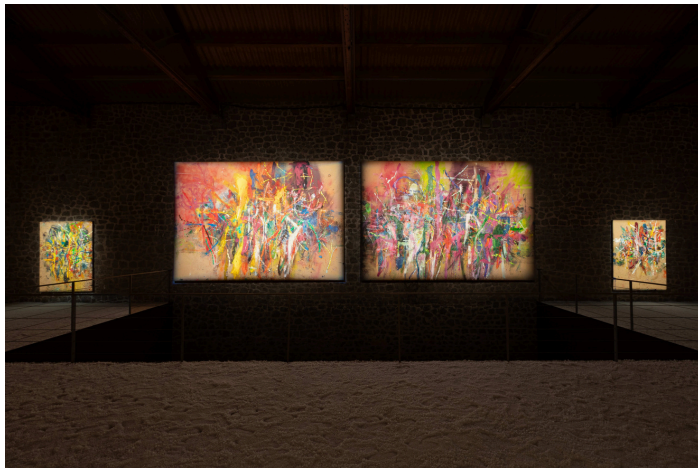
Exhibition view: Spencer Lewis, La noche de día (Night by Day) , Fundación La Nave Salinas, Ibiza (21 June–8 August 2025).