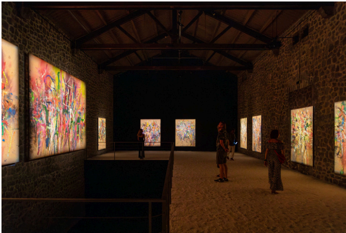
Exhibition view: Spencer Lewis, La noche de día (Night by Day) , Fundación La Nave Salinas, Ibiza (21 June–8 August 2025).

Malca emphasises that works shown at La Nave are selected not just for their formal qualities but for their ability to engage with the unique spatial and historical context of the venue: 'The pieces truly aren't finished until they're in the space.'